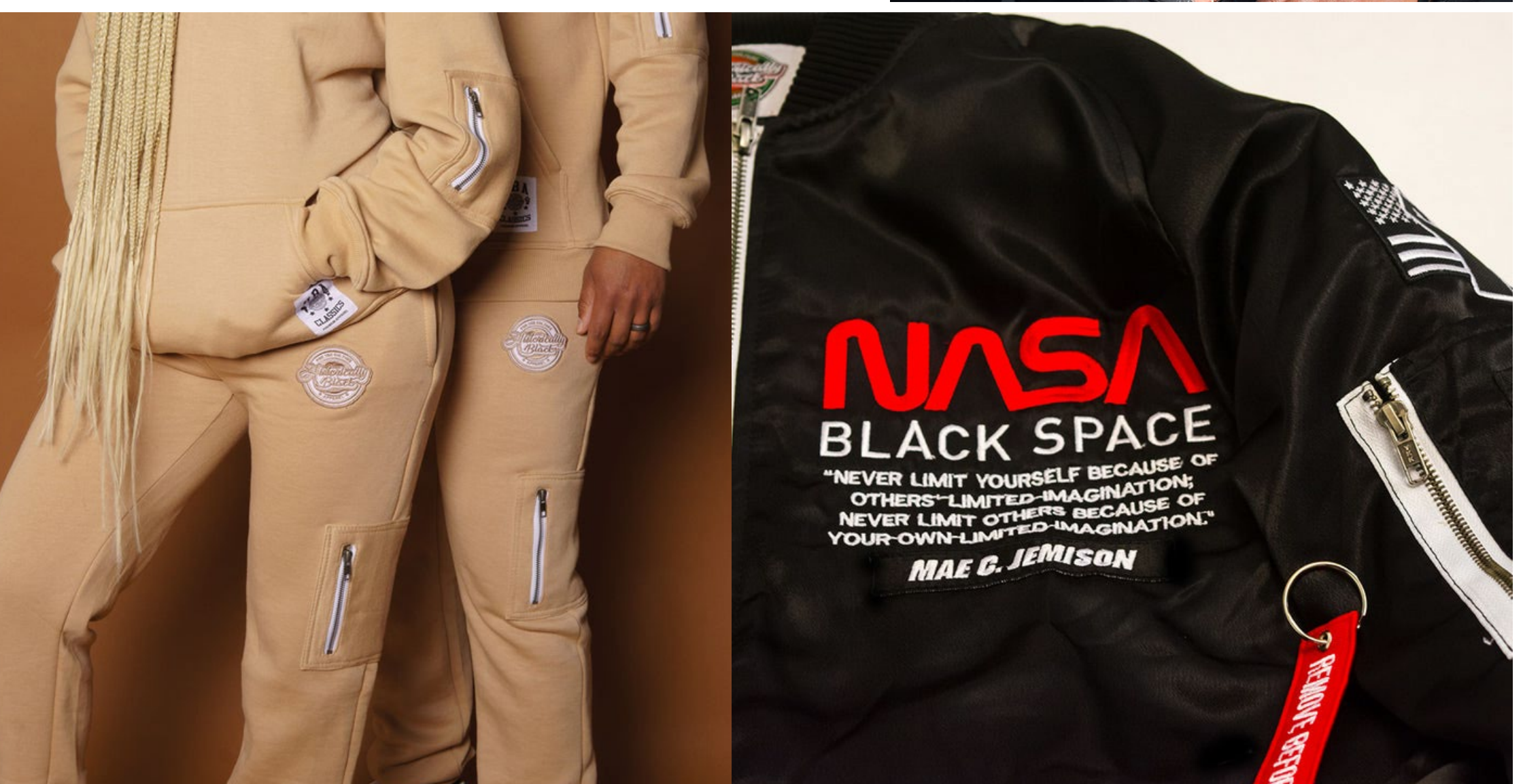
Engagement Award Prizes